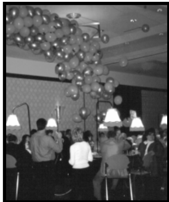
"3, 2, 1. . .HAPPY NEW YEAR!!" A scene from 'Celebration in Times Square', the Convention wrap-up party

At the recommendation of the MTA Industry Planning Committee, a one-day day Technical Conference was offered in September at the Radisson Hotel in St. Cloud. The conference featured some of the newer technologies available to telecommunications providers – DSL, Voice over IP, ATM and Softswitching – and was attended by 125 members. Based on the positive feedback received in the evaluation forms, future programs highlighting new technologies will be offered in 2001.